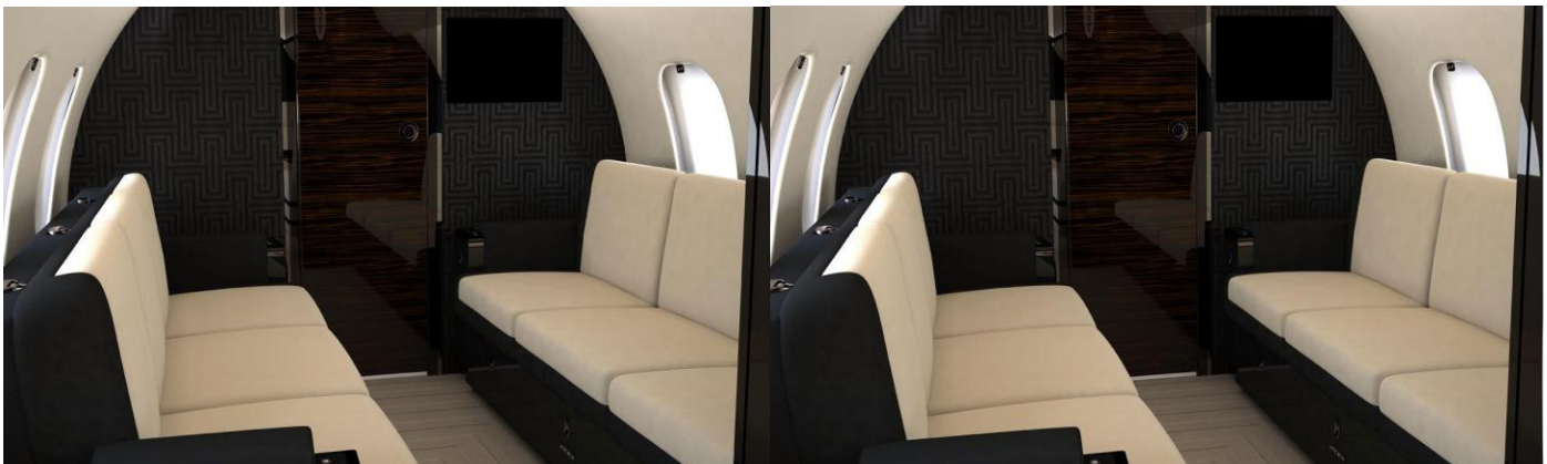
Images are renderings of the selected interior