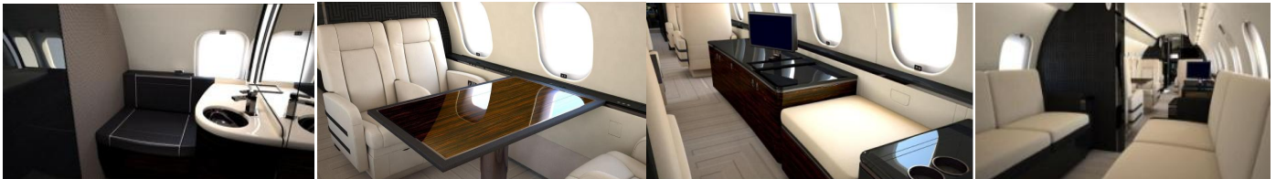
Images are renderings of the selected interior