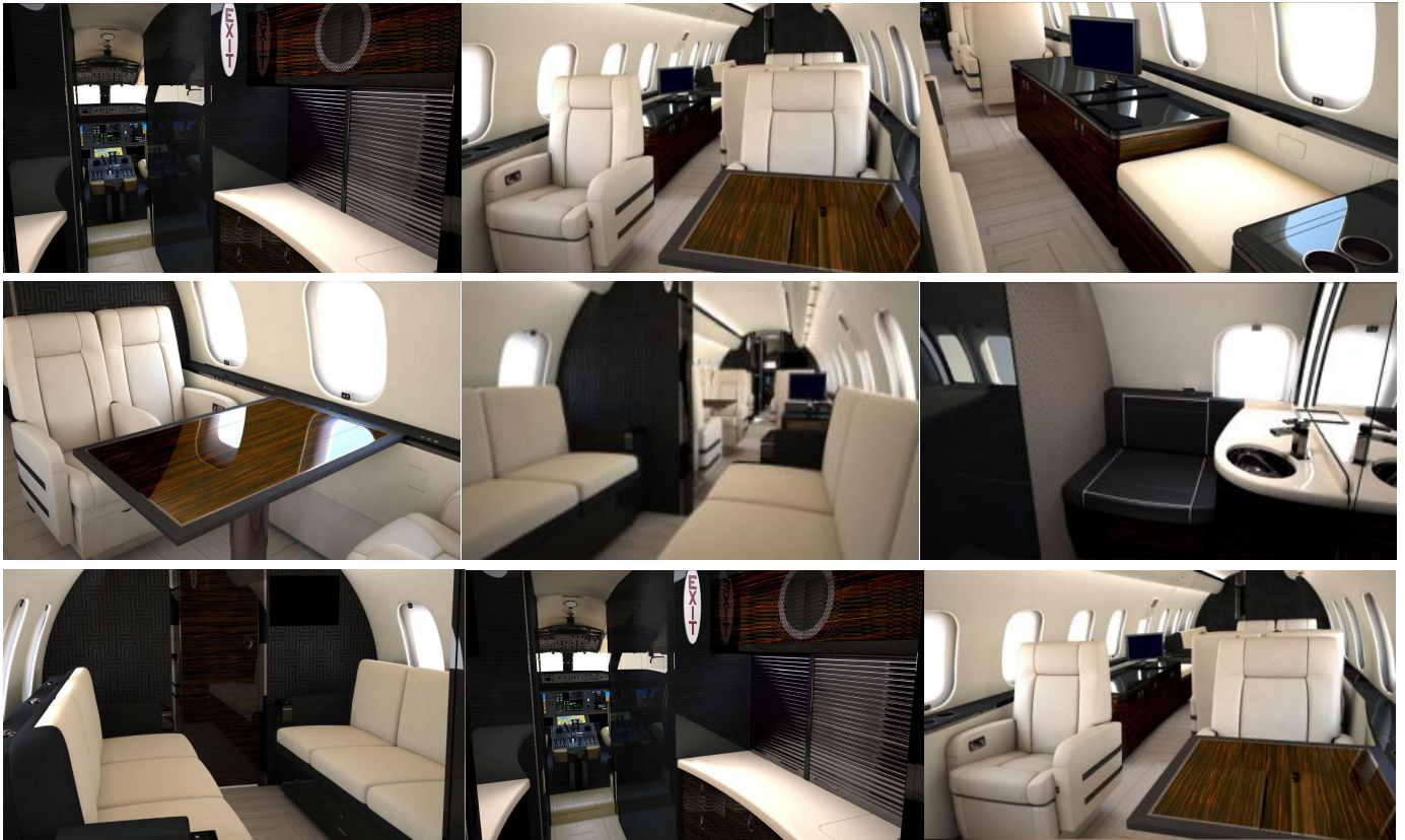
Images are renderings of the selected interior