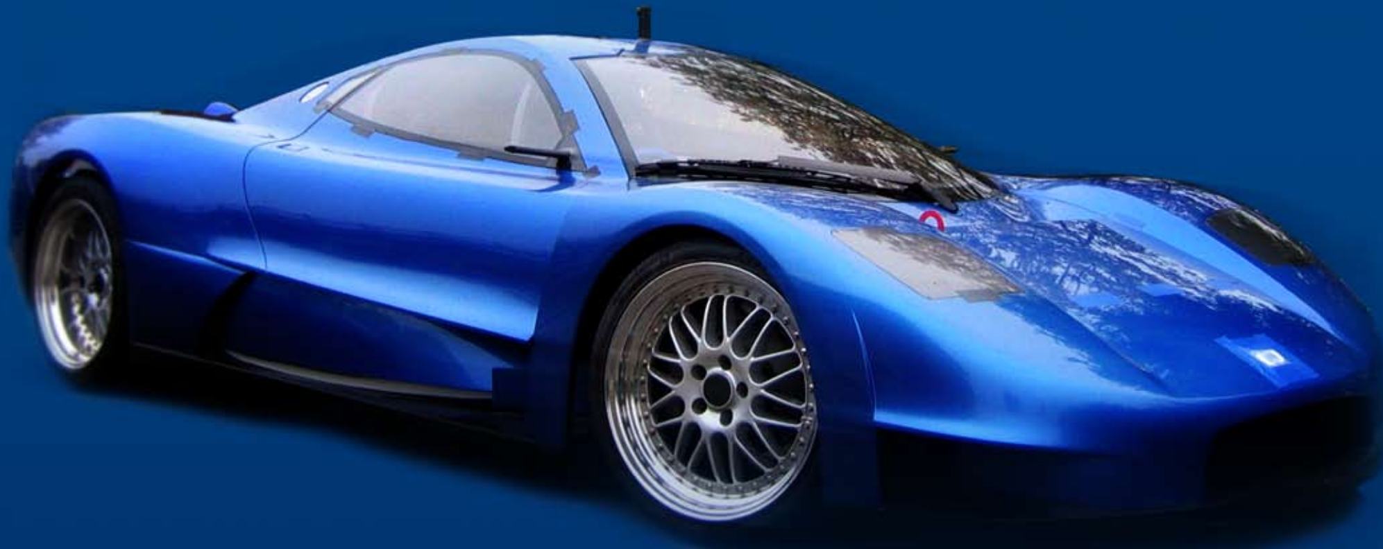
This image is of the current JOSS test vehicle the JOSS JT1