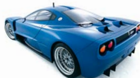
These images are of the current JOSS test vehicle the JOSS JT1